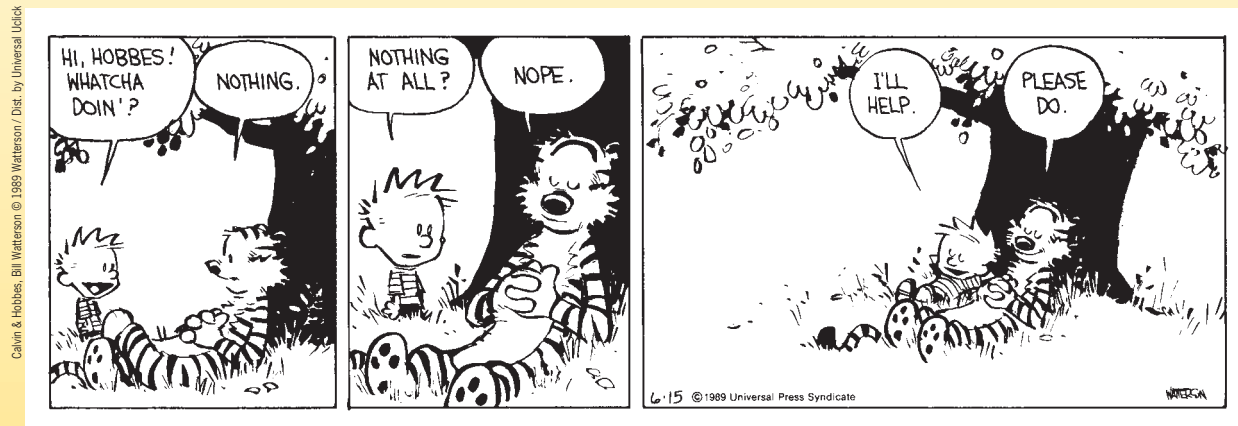
Extracted from: The Revenge of the Baby – sat by Bill Watterson: Andrews McMill Publishing, p. 85, Jan. 1, 1991.

1 Listen and read the comic strip to answer the question. What are Calvin and Hobbes doing to relax?